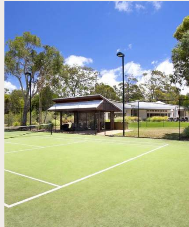
TENNIS COURT & BASKETBALL HOOP

Our Games Room brings together guests of all ages, with activities for both young and old. Play a game of pool, challenge friends on the PlayStation or Xbox.